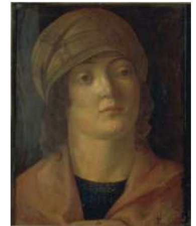
Giovanni Bellini- Ritratto femminile

Prelievo microistologico sotto guida ecografica Carcinoma duttale infiltrante di grado nucleare intermedio-alto B5b